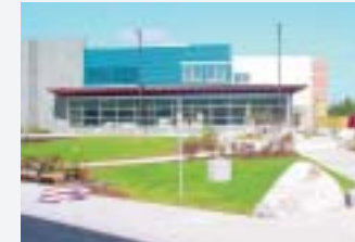
Halifax West High School

Of the 24 technically advanced schools Rideau has built to date, 13 were part of the Nova Scotia Private Public Partnership projects for the Scotia Learning Centres Consortium.