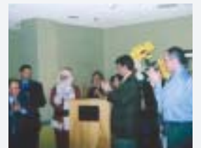
The Rideau Christmas Party took place Saturday, December 6, at the Halifax Citadel, where everyone had a great time! Merry Christmas to all!