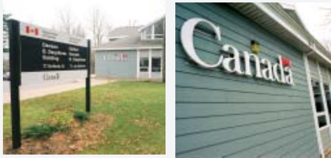
Government of Canada Building

As Rideau's inaugural project in 1993, the Government of Canada Building in Bridgewater, Nova Scotia, presented a number of unique challenges. The client required a modern building with the latest energy-saving materials and conveniences, but would still conform to the old-style feel and traditional architecture of the surrounding residential neighbourhood.