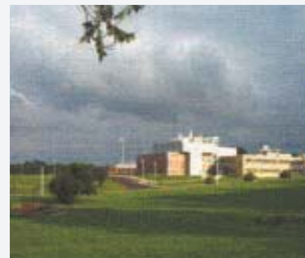
Potato Research Facility