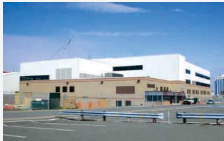
Combat Systems Repair Facility

The Combat Systems Repair Facility is owned by Defense Construction Canada. The building is used to repair hi-tech, top secret ammunitions and sonar systems for the Canadian navy. Two overhead cranes, 10 and 15-ton, are used to unload navy guns located on the front of frigates.