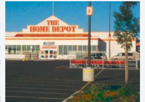
Home Depot - Moncton