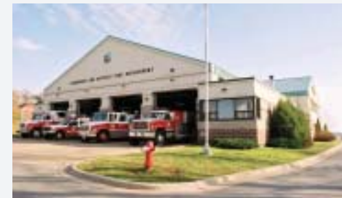
Lunenburg Fire Hall