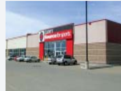
McAllister Drive Plaza

A strip mall constructed of structural steel, EIFS walls, masonry on exterior walls and metal siding, McAllister Drive Plaza has space for three tenants including McDonald's Restaurants and Cleve's Sporting Goods.