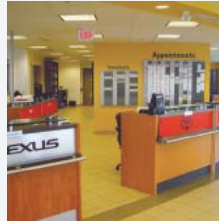
Exterior and interior photo of O'Regan's Lexus Toyota