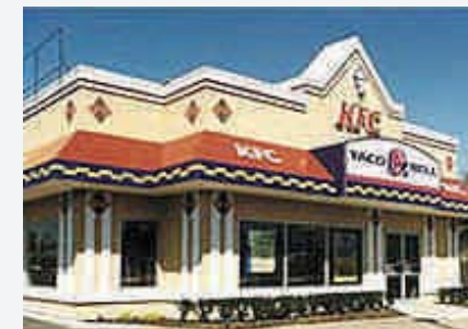
KFC Taco Bell Program

Rideau/2, our small job division, was selected by KFC in 1994 to carry out the Taco Bell Program involving the renovation to 13 KFC outlets throughout Nova Scotia and New Brunswick. Since that time, Rideau has completed more than 20 projects for KFC. The restaurants were fully renovated to accept the Taco Bell product line, while continuing to operate regular hours as a KFC restaurant. The renovation program started in Spring 1996 and was completed in Winter 1997.