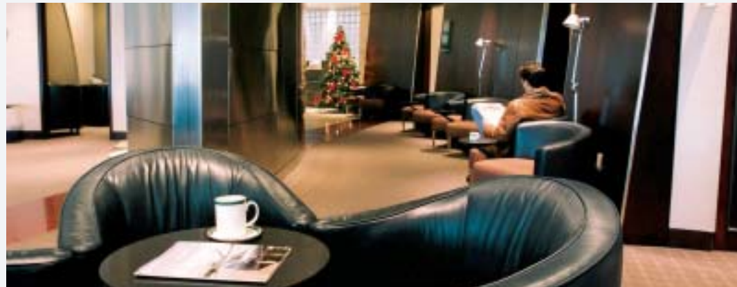
Maple Leaf Lounge

The Halifax Airport Improvement program included more than $25 million in improvements and upgrades, including the construction of the Maple Leaf Lounge. Air Canada's award-winning Maple Leaf Lounges provide travelers with private and serene hideaways in the midst of action packed airports. While constructing the lounge, Rideau had to ensure it could accommodate the many visitors and available services including complimentary beverages, light snacks, a selection of newspapers and magazines, televisions, full business amenities and a conference room. The construction of the Maple Leaf Lounge has made the Halifax International Airport much more efficient and user friendly.