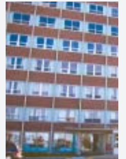
St. Joseph's Hospital

During the 90s, St. Joseph's Hospital found it had outgrown itself, particularly in the geriatric wards and operating theatres. As a result, Joseph's sought approval for a major upgrading of the facility to accommodate a new discipline of accountability developed for hospitals, and a new era of co-operation evolved between managers, nurses, doctors and other professionals in monitoring effective care in relation to resources. The sophisticated system of health care required high tech equipment and computerized management and information systems.