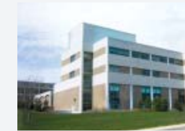
K.C. Irving Hall, University of New Brunswick Saint John (UNBSJ)

Consisting of structural steel, pre-cast concrete and aluminum curtain wall, the construction took place over 12 months. Today, the $4.5 million building provides