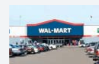
Wal-Mart - Saint John

The construction included a structural steel, single level building with foundations founded on structural piles and an EPDM roof. It also included all mechanical and electrical systems, and interior and exterior finishes. This