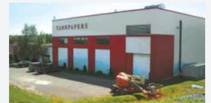
Tann Paper Limited

During the mid-90s, Tann Paper found themselves in need of additional space to meet the demands of their changing industrial business. Working with Gradon+Kapkin Architects, Cardinal constructed a 40,000 sf addition to Tann Paper's industrial plant. The construction management project included a 20,000 sf expansion for new base paper storage, a new Ceruti (a machine which places five different colours of ink onto cigarette papers), and a new Brio Printing Press.