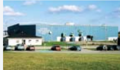
The Lunenburg Regional Recycling Facility

In 1995, the Government of Nova Scotia introduced an ambitious new program - to reduce the amount of waste going to landfills by 75 per cent. The province chose the Lunenburg Regional Recycling Facility, Nova Scotia's newest state-of-the-art waste management facility, as the venue to announce that landmark program.