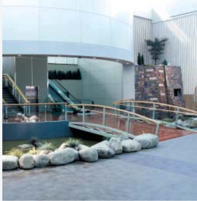
Air Terminal Building at the Halifax International Airport

This construction was logistically challenging in terms of working in the middle of an operating facility. The Rideau team worked through two winters and had to continually take into consideration the comfort and safety of passengers, and the needs of the airport and their tenants.