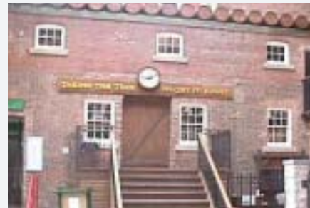
Exterior and interiors of Alexander Keith's Nova Scotia Brewery

Completed in June of 2000 to rave reviews from the public, the retrofit involved the coordination of an existing historic building, new construction and remodeling to circa 1860, complete with the installation of an owner-supplied microbrewery. The designer for the restoration of the brewery was CBCL/Connors Architects. Rideau also worked in close conjunction with Cadillac Fairview, the landlord of the Brewery Market Facility. This project earned Rideau the "Oland's Brewery Seal of Distinction Honor for 2000."